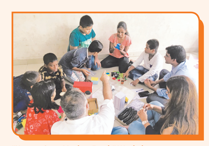
"How to Save Mother Earth" Workshop with Magic Bus

Carried out in the Central Indian state of Madhya Pradesh, this 3-year programme aims to train 250 healthcare professionals in maternal and child health to prevent disease and reduce mortality.